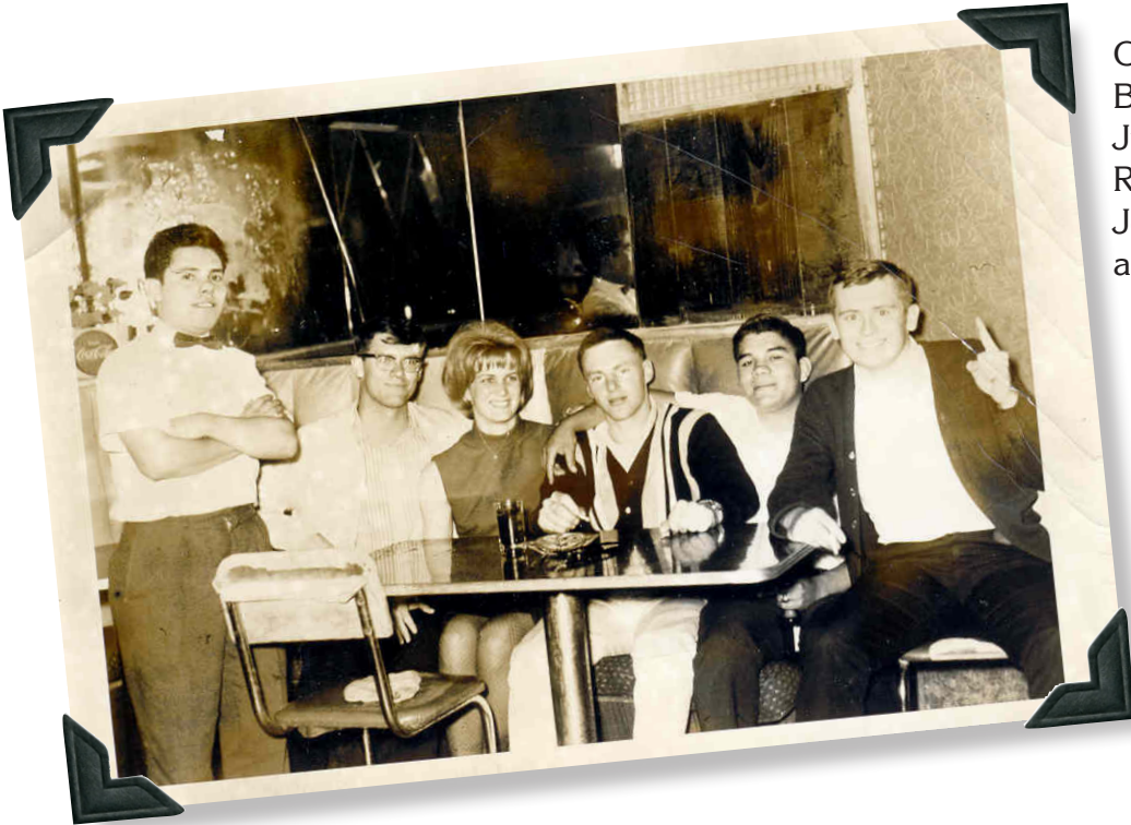
Official meeting of the Juarez Bombers. The Submarine in Juarez 1965.